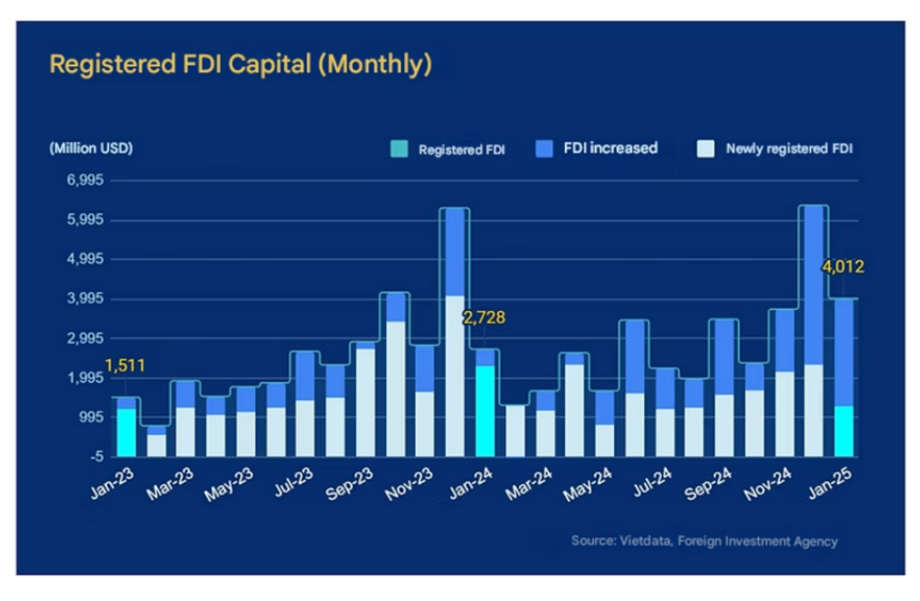
January 2025 witnessed a promising start for FDI attraction in Vietnam. Total registered capital reached 4.01 billion USD, a 47% increase, YoY. (Source: Vietdata's Macro and Industry Report, Feb 2025)

Vietnam enters 2025 with a track record of policy continuity and a growing reputation as a stable partner amid fluctuating global dynamics.